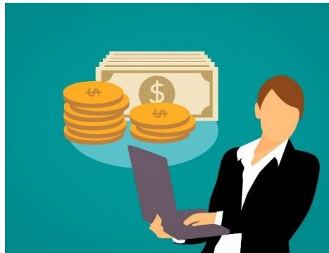
Image from Creative Commons https://pixabay.com/en/selling-business-woman-online-store-3213725/